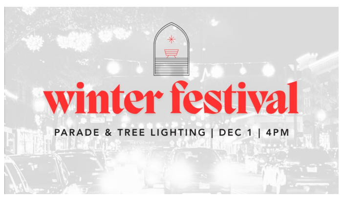
Christmas Outreach parade on Main St & tree lighting at Town Plaza sign up with the QR code inside this bulletin