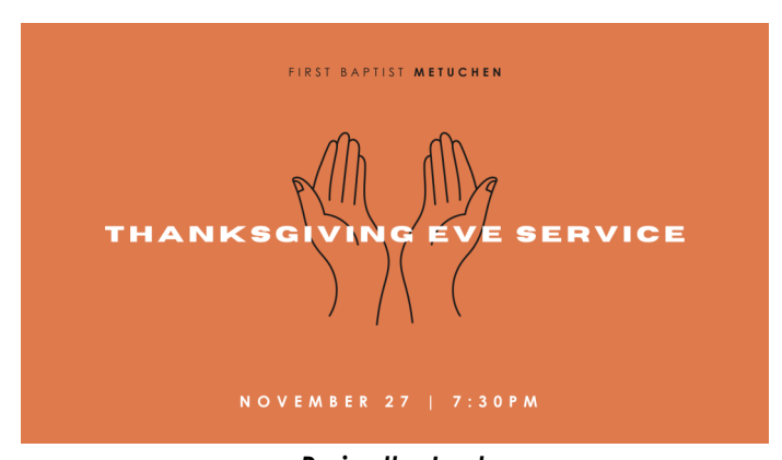
Praise the Lord for all His blessing with prayer and worship.