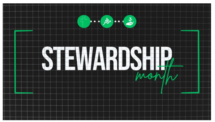
How are we using our God-entrusted resources? November is Stewardship Month.